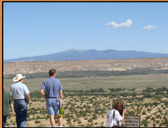
Mt. Taylor as seen from Acoma Pueblo.